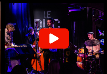
Live Duc des Lombards - From Nowhere