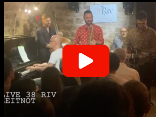
Live 38riv - Zeitnot