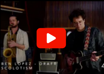
Video Studio - Scolotism