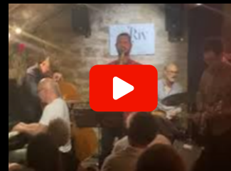
Live 38riv - 3 temps